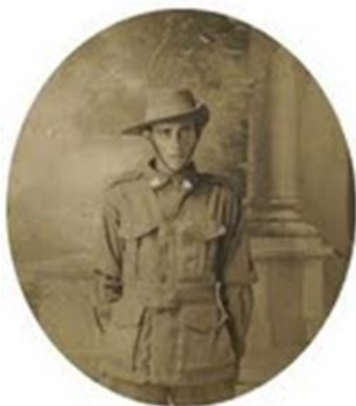
TOP END FILIPINOS IN THE AUSTRALIAN IMPERIAL FORCE (AIF)