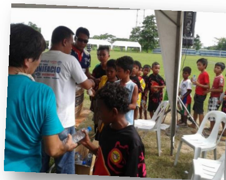
FAT BOYS 10'S – CHALLENGER FIELD – CLARK – ANGELES CITY

Anyone making slanderous remarks should look at Article 353 of the Revised Penal Code of the Philippines.